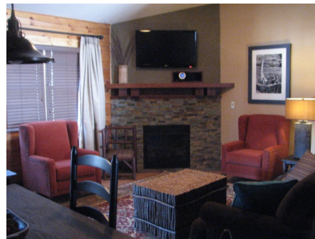
Exterior Timber Model