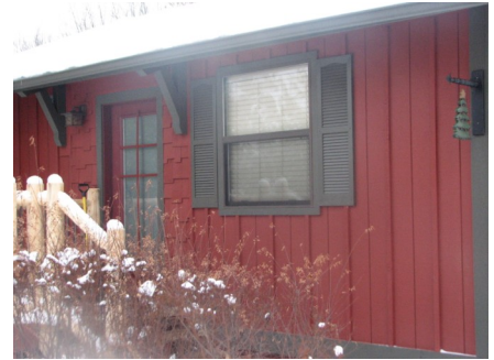
Exterior Cottage Model