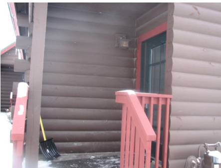
Exterior Timber Model