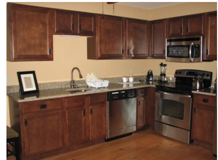
Interior Deluxe Timber Model