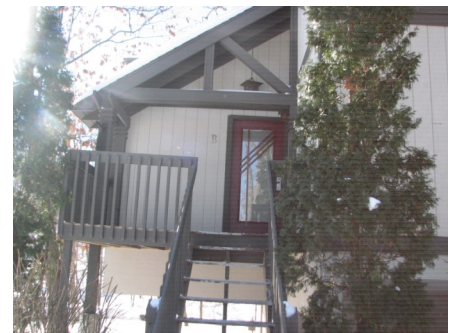
Exterior Townhome Model