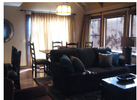
Interior Townhome Model

To view all Model pictures/presentation please visit