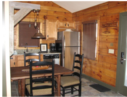
Interior Cabin Model