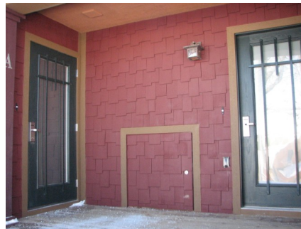
Exterior Deluxe Timber Model