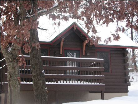
Exterior Cabin Model