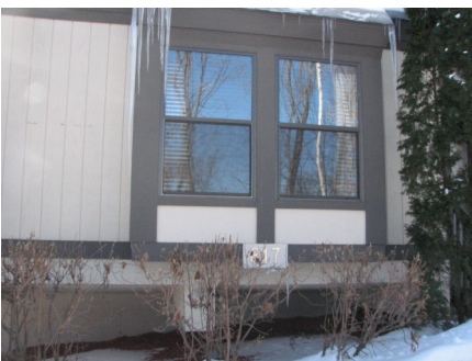
Exterior Townhome Model