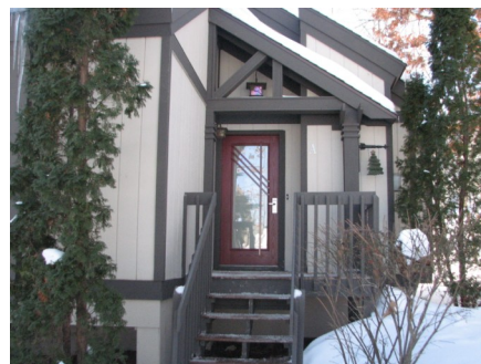
Exterior Townhome Model